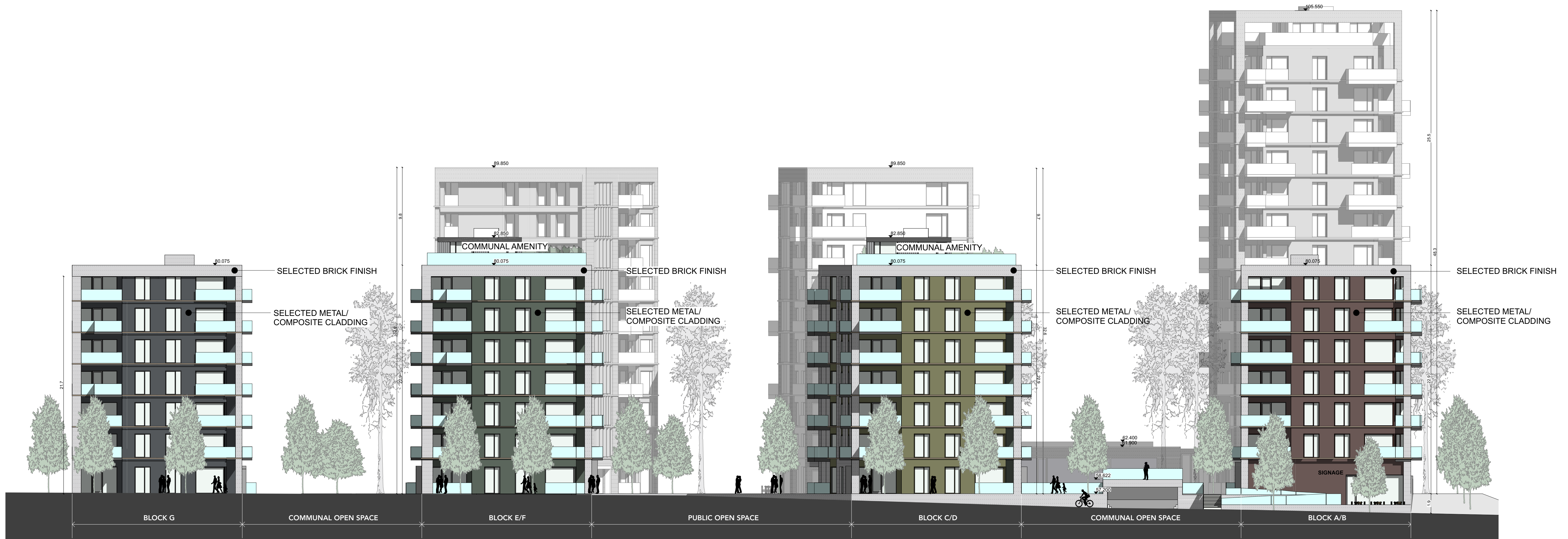
South Elevation SCALE : 1:200

NOTES WALL FINISHES TO BE BRICK/METAL/COMPOSITE CLADDING AS INDICATED. ROOFS TO BE GREEN ROOF TYPE. BALCONIES TO BE GLAZED.